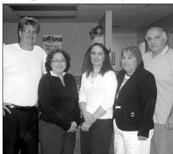
Putting clients at ease.

manufacturers, a 60-day trial period on new hearing aids, and a two-year manufacturer warranty. They've earned their reputation for honesty and integrity! Come join the 10th anniversary celebration open house on Tuesday, Oct. 9th from 9am-noon with a live broadcast from 740AM. Drop by for demonstrations, prizes, and giveaways! Chatten's, located at 340 King St. W., follows the government pay schedule and can direct-bill to most extended health care plans. Visit www.chattenshearing.com . Call 905-432-7464 to book a complimentary hearing test.