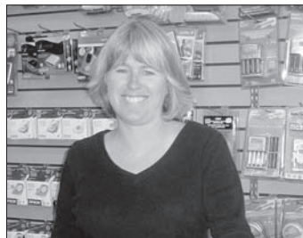
Caring about your memories.

needed – even when you use the self-serve kiosk. For added convenience, use their online photofinishing service. Trust your memories to a long-standing company with a proven reputation and the latest digital technology! Ready to take advantage of digital photography or want to upgrade an older camera? Not only are their cameras competitively priced, you can count on Aldsworth's trained professionals for knowledgeable advice, instruction, and service. Capture life's special moments with trusted brands like Canon, Nikon, and Sony. Visit Aldsworth's Photo World at 907 Simcoe St. N. or www.aldsworthphoto.ca . Call 905-576-5123.