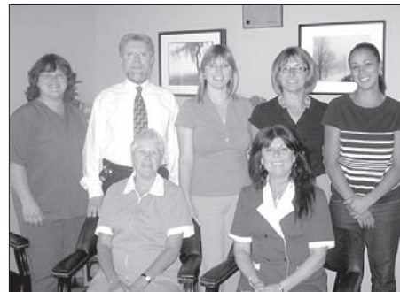
Friendly, knowledgeable service.

The Chiropractic Centre, located at 18 Gibbons St., offers direct billing to Green Shield. Book an appointment at 905-728-5512. Watch for their upcoming Open House in October.