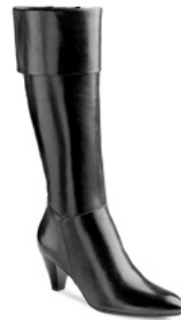
Boots, boots, boots at Brock's on Foot.

And when visiting Brock's on Foot, don't miss the women's wear and men's wear shops offering great weekend looks by Columbia, Woolrich, Linda Lundstrom and more - three stores under one roof. Brock's on Foot - 168-178 Queen St, Port Perry, 905-985-2521 or visit their web site www.brocks.ca .