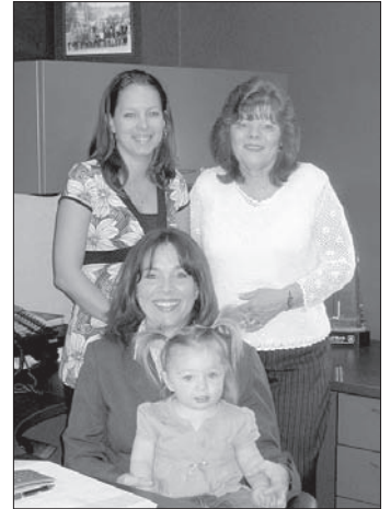
Protect your family and your future.

Call Tammy-Lee Hanlon at 905-720-2500 for a competitive price quote and save up to 40% when you insure your home and vehicle together. Located at 169 Simcoe St. N. in Oshawa.