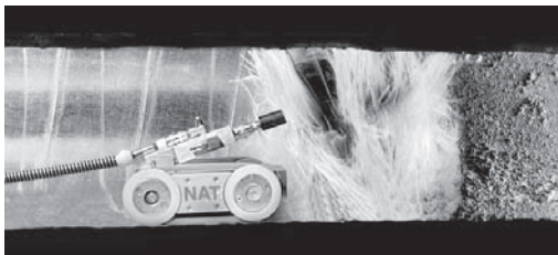
Duct cleaning makes breathing easier.