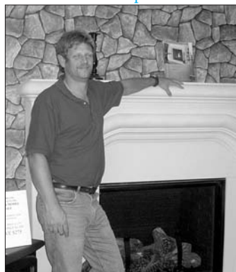
Keep cold weather outside.

Don't get caught in the cold this winter! Visit Woodland Fireplaces, located at 898 Simcoe St. N. Call 905-579-3122. www.woodlandfireplaces.ca .