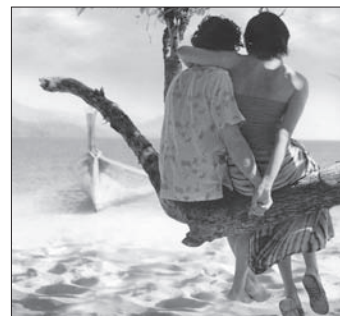
Make Marlin Travel your first destination!

Together with feedback from returning clients, they can recommend destinations, hotels, and more! Marlin Travel represents all major tour operators and cruise lines, so they can help you create a holiday that meets your dreams and needs, while getting the most out of your holiday allowance. Visit Marlin Travel in the Oshawa Centre at 419 King St. W. or www.marlintravel.ca/oshawacentre . Call 905-723-7726.