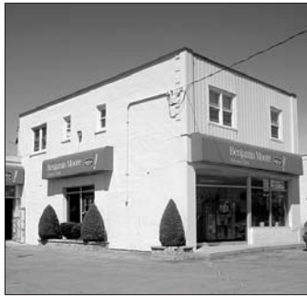
Celebrate with Oshawa Paint and Wallpaper.

Country FM will broadcast live from Oshawa Paint and Wallpaper from 5pm - 7pm. During the week of October 14th they will offer incredible low prices on all Benjamin Moore premium paints as a special thank-you to their customers. Then, enjoy the charity BBQ on Saturday, October 20th with all proceeds benefiting Grandview Children's Centre. And don't forget that every week in October features special promotions and giveaways! Oshawa Paint and Wallpaper is located at 894 Simcoe St. N., at the corner of Simcoe and Switzer Drive; call 905-721-2854.